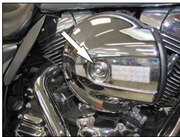
3. Remove the bolt securing the air filter cover and then remove the cover from the vehicle.