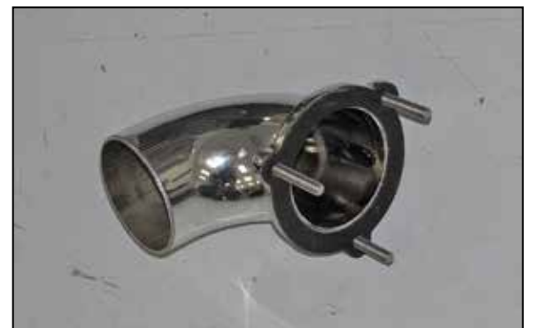
6. Install the three provided tube mounting bolts into the K&N® intake tube and then install one of the two provided gaskets onto the bolts.

NOTE: K&N Engineering, Inc., recommends that customers do not discard factory air intake.