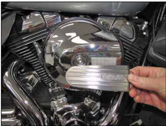
2. Remove the decorative badge from the air filter cover.

1. Turn off the ignition and disconnect the negative battery cable. NOTE: Disconnecting the negative battery cable erases pre-programmed electronic memories. Write down all memory settings before disconnecting the negative battery cable. Some radios will require an anti-theft code to be entered after the battery is reconnected. The anti-theft code is typically supplied with your owner's manual. In the event your vehicles anti-theft code cannot be recovered, contact an authorized dealership to obtain your vehicles anti-theft code.