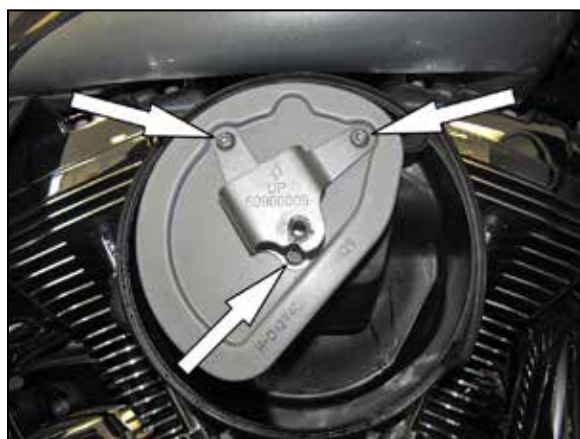
4. Remove the three bolts which secure the factory air filter to the base plate and then remove the air filter from the vehicle.