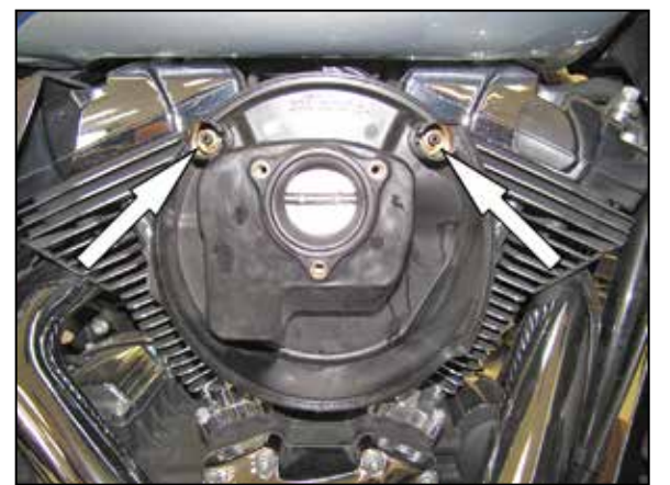
5. Remove the two factory crank case breather bolts and then remove the filter back plate from the vehicle.

NOTE: K&N Engineering, Inc., recommends that customers do not discard factory air intake.